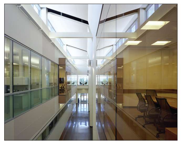
Figure 6. The main arterial circulation street in the administration building provides natural daylight into the interior spaces along with providing visual connections between the lab and office areas.

staff would be working in controlled areas, combined with the restrictive winter climate, it became important for the facilities' culture to provide open, interactive spaces - Figure 6. The main spine through the administration building and large cafeteria seating area, named the Great Hall, with its fireplace and capability for large-screen projection, are envisioned as key social hubs to provide the workforce with a refuge for relaxation - Figure 7.