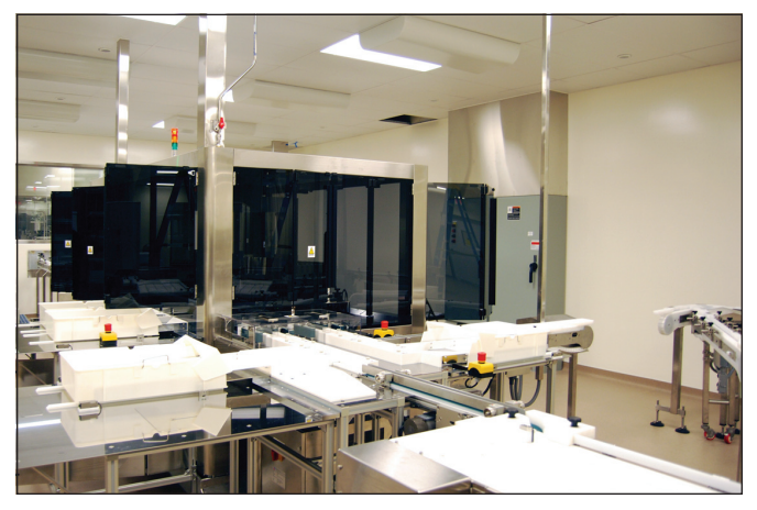
Figure 5. Inspection lines are visually connected to the fill suites to ensure ease of communication. Within the inspection suite, there is the capability for both automated and manual inspection.

Maintaining sufficient resources and leveraging the Factory