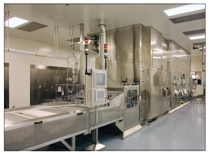
Figure 3. The fill line incorporated depyrogenation through capping within the isolator, including sterile stopper loading and automated lyo loading/unloading with all controls through an HMI.

materials, raw and finished, enter and exit through the same side of the super-block building.