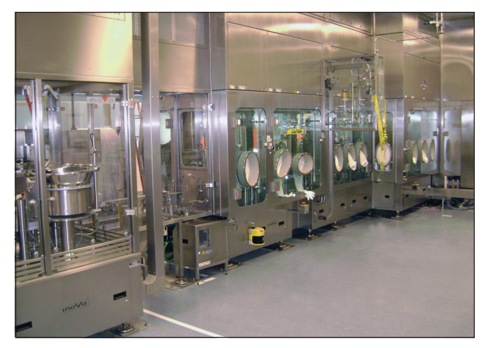
Figure 4. Isolator technology provides improved user comfort, due to reduced gowning requirements, while maintaining critical environmental control.