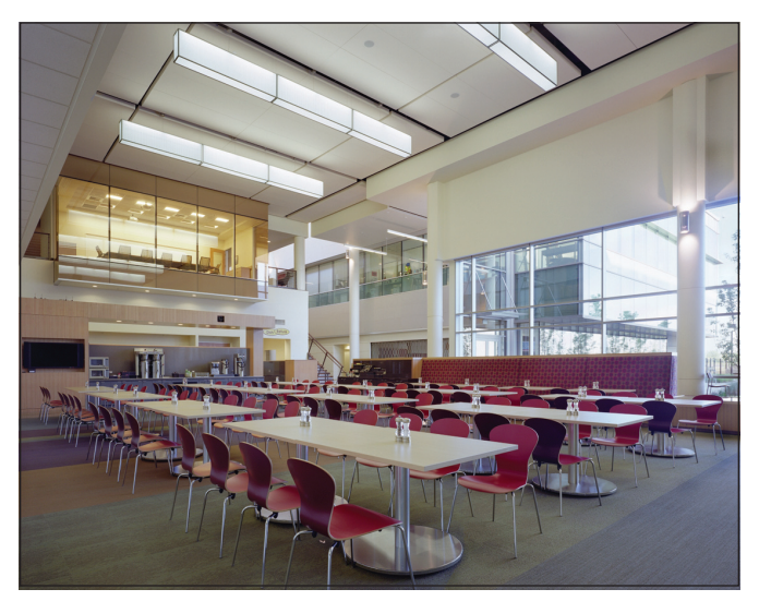
Figure 7. The Great Hall was conceived to provide a collaborative and community building environment incorporating multiple amenities. Functions include the cafeteria seating area, training room break out space, viewing windows in the manufacturing building, and a fireplace with a large format projection screen.

To create a target budget, first the scope of the project was